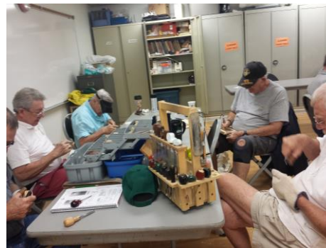
Always carving to be done